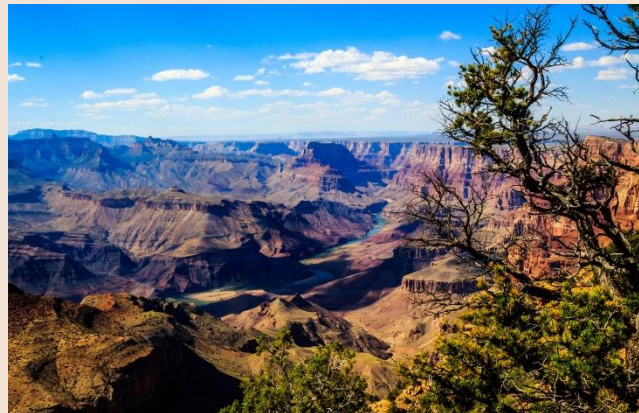
Above: Hidden high in a cliff overlooking the Colorado River in the Grand Canyon, an explorer claimed to have discovered a cave filled with artifacts indicating the presence of an ancient Egyptian lost civilization. Nice view, but was it all an April Fools' Day joke?

Have you heard that ancient Celts visited Colorado and left a written message proving their presence? And how about evidence of the vast Arizona cave system that housed a community of as many as 50,000 Egyptians dating to the reign of the Pharaoh Ramses?