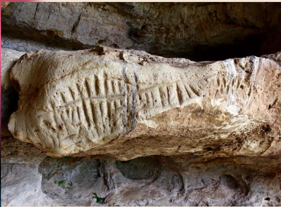
Above: If you search for "Crack Cave, Colorado" in Google Images, this piece of rock art is highlighted. It is, ostensibly, a written message left by ancient Celts who visited America. The only problem is that it isn't in Crack Cave and it's a Native American petroglyph, probably representing a centipede.

Did you know that archaeological evidence of an ancient community of Jewish settlers was discovered in Arizona in 1924?