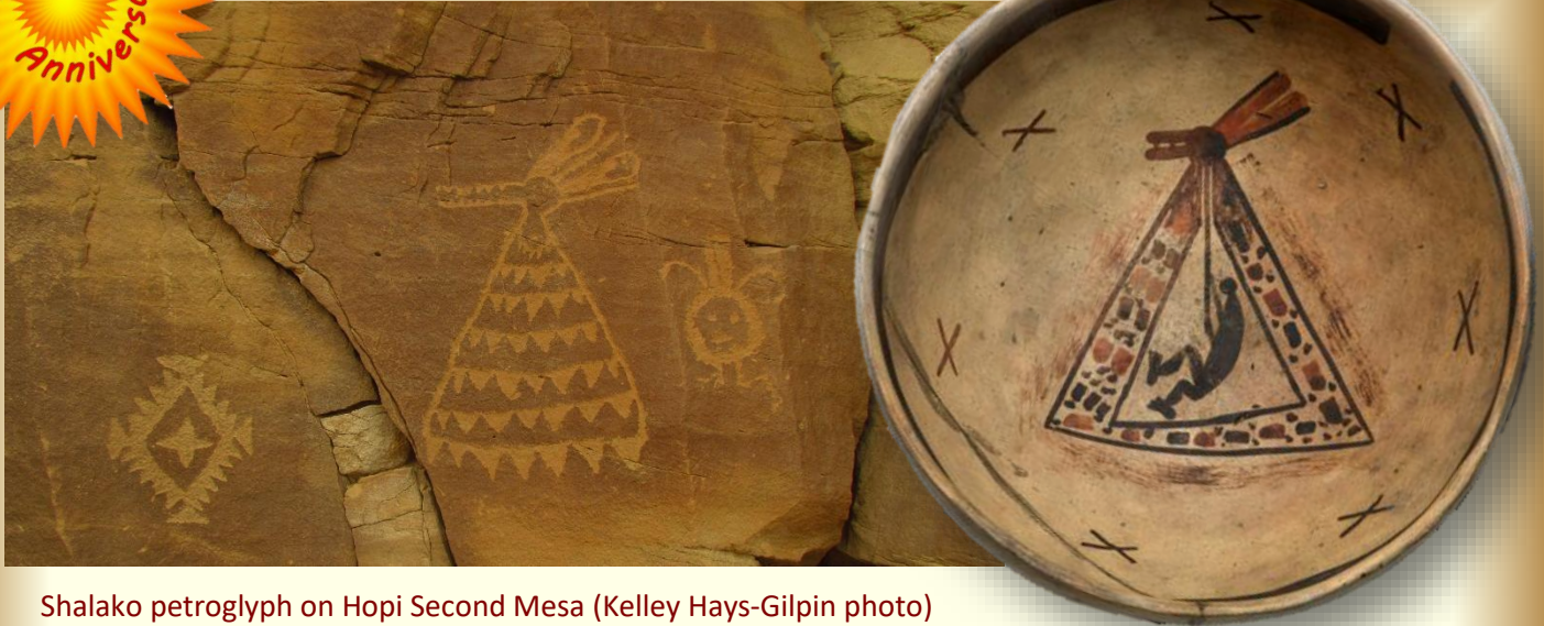
Shalako petroglyph on Hopi Second Mesa and Shalako image on Sikyatki Polychrome bowl

Join us in January to celebrate the 20TH ANNIVERSARY of Old Pueblo Archaeology Center's "Third Thursday Food for Thought" public presentations series!*