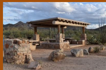
Some outstanding examples of CCC architecture in the historic Signal Hill Picnic Area