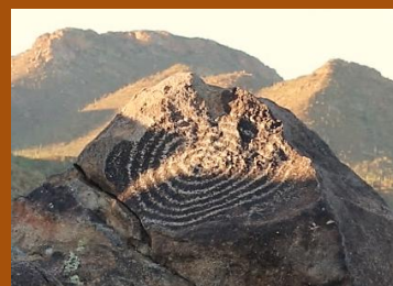
Petroglyphs at the Signal Hill site include this spiral on which a "sun dagger" forms every summer solstice morning

Contact Old Pueblo Archaeology Center at info@oldpueblo.org or 520-798-1201 to register or for more information.