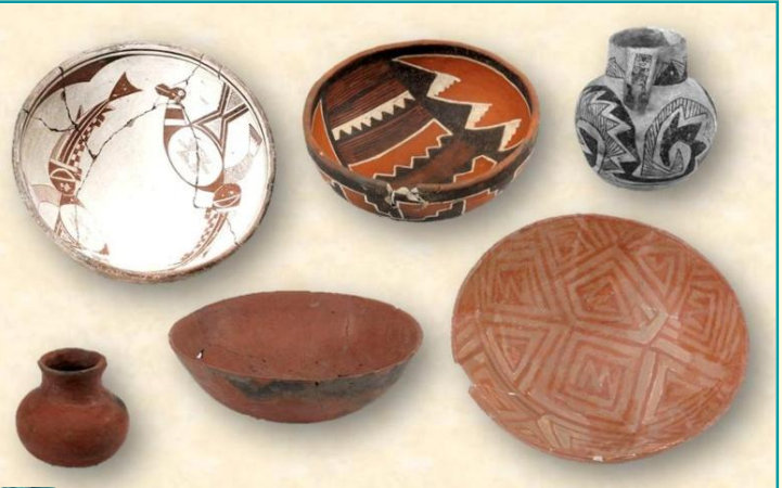
Some Mogollon pottery, clockwise from upper left: Mimbres Black-on-white bowl, Four Mile Polychrome bowl, Reserve Black-on-white pitcher, Mogollon Red-on-brown bowl, San Francisco Red bowl, and San Francisco Red jar

6:30-8:30 pm Mountain Standard Time* each Wednesday