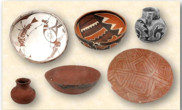
Some Mogollon pottery, clockwise from upper left: Mimbres Black-on-white bowl, Four Mile Polychrome bowl, Reserve Black-on-white pitcher, Mogollon Red-on-brown bowl, San Francisco Red bowl, and San Francisco Red jar

* Southern Arizona does not go on Daylight Saving Time.