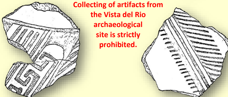
Collecting of artifacts from the Vista del Rio archaeological site is strictly prohibited.