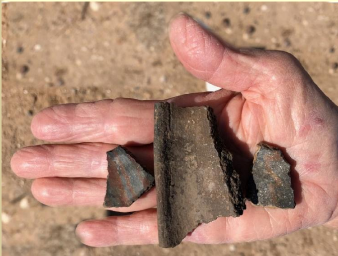
Some pottery sherds found at Tucson's Vista del Rio Cultural Resource Park

In celebration of Arizona Archaeology and Heritage Awareness Month, the Vista del Rio Residents Association and Old Pueblo Archaeology Center have teamed up to offer this FREE archaeologist-guided visit to Vista del Rio, an ancient settlement in the City of Tucson's Vista del Rio Cultural Resource Park that was inhabited by people of the Hohokam archaeological culture 800 to 1,000 years ago – sometime between 1000 and 1200 CE.