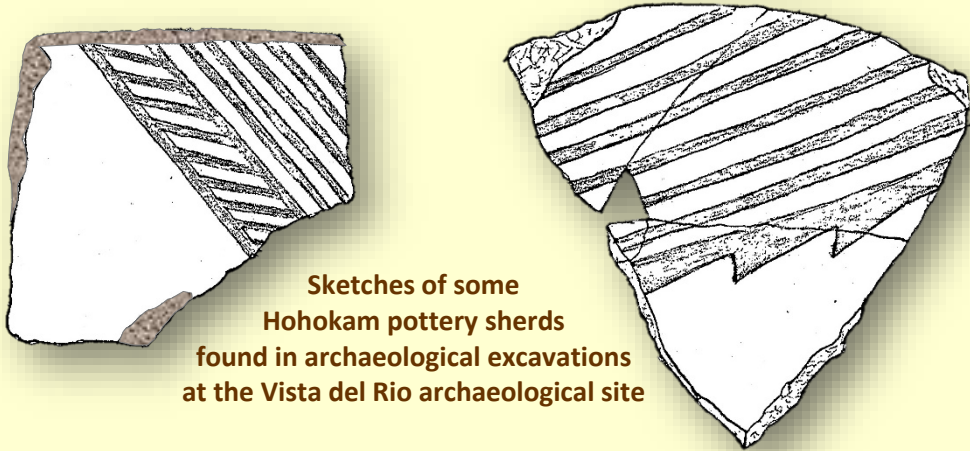
Sketches of some Hohokam pottery sherds found in archaeological excavations at the Vista del Rio archaeological site