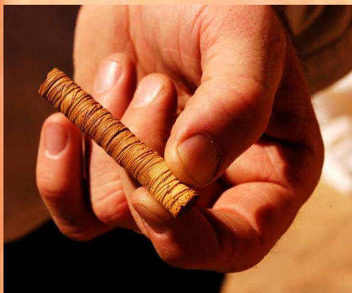
Tree-ring core from Painted Kiva House