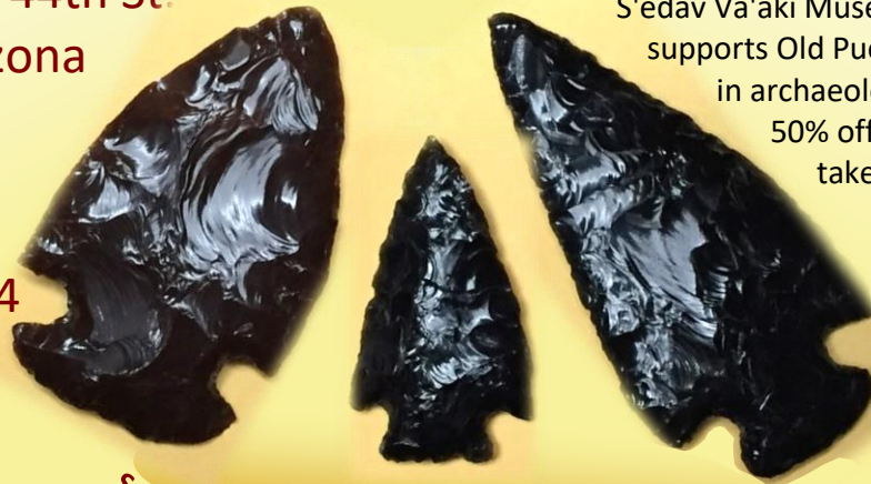
Some projectile points made by the workshop instructor:

Donation is due 10 days after reservation request or by 5 pm Thursday August 8, whichever is earlier.