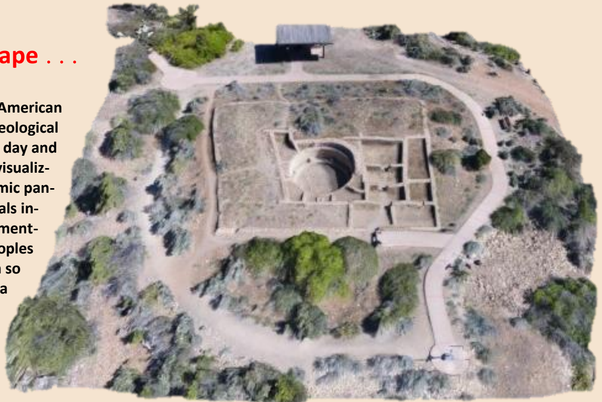
3D Model of Escalante Pueblo, SCAAS Cultural Landscapes Survey Program

The Society for Cultural Astronomy in the American Southwest studies the connection of an archaeological site to astronomical cycles and features in the day and night sky, and explores new technologies for visualizing buildings and the landscape, such as dynamic panoramas, 3D modeling, and infographics. Its goals include establishing a common method of documenting and visualizing links between ancestral peoples and the land and sky that surrounded them so that we can better understand that we live in a unified cultural landscape, inseparable from its parts.