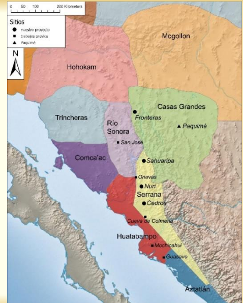
Formative period archaeological cultures of the US Southwest and Northwest Mexico

The Mexican Northwest frequently has been invoked as a tierra incognita in grand schemas of continental history. Was it the origin point for major social movements? The source or destination of populations known from the US Southwest? Or even more basically, is there continuity in traditions from the US Southwest to Mesoamerica? Thanks to decades of work by Mexican and international archaeologists we can now begin to place Northwest Mexico in its rightful place in continental scale narratives.