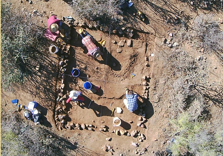
Drone photo of archaeologists excavating a rock-foundation structure in Chihuahua, Mexico