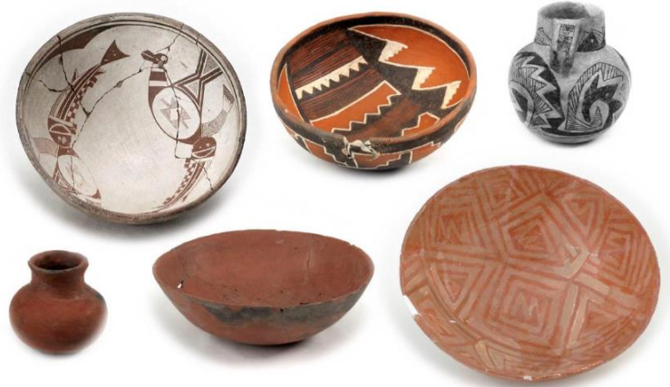
Some Mogollon pottery, clockwise from upper left: Mimbres Black-on-white bowl, Four Mile Polychrome bowl, Reserve Black-on-white pitcher, Mogollon Red-on-brown bowl, San Francisco Red bowl, and San Francisco Red jar

* Southern Arizona does not go on Daylight Saving Time, so participants outside of Arizona may need to adjust for time zone differences after March 10.