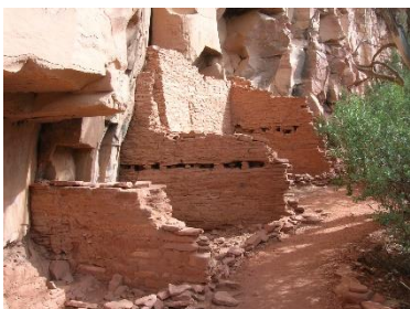
A section of the Honanki cliffdwelling

DAY TWO: At 8:30 am on Sunday we will meet at a prearranged site near Interstate-17 and AZ-179 (Sedona exit). We can carpool (again, high clearance vehicles recommended) to the Rarick Canyon area, first to see Sinagua petroglyphs at the Spirit Hunter site, which overlooks an 800-foot-deep canyon . The hike is relatively short, about ½-mile and then about 80 feet along a 5-foot-wide (at its narrowest) ledge to access the main rock art panel area. The route is all flat with no scrambling or climbing required, but please note that the rock art is located at a 20-foot-wide area overlooking a steep canyon, and the access requires a short walk along a 5-foot-wide ledge at times. People with extreme fear of heights may want to avoid this hike.