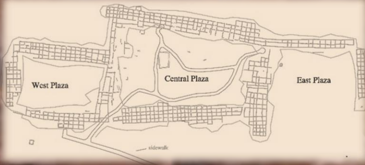
Ground plan of Homol'ovi II Pueblo, inhabited during the Late period, Homol'ovi phase between 1360 and 1400

Optional Friday group dinner suggestion: Members of our group are welcome to get together for dinner in the Turquoise Room restaurant in Winslow's La Posada Hotel – one of the historic original Fred Harvey southwestern railroad hotels. If you want to be part of our dinner group, make your reservations with Al Dart rather than calling the restaurant.