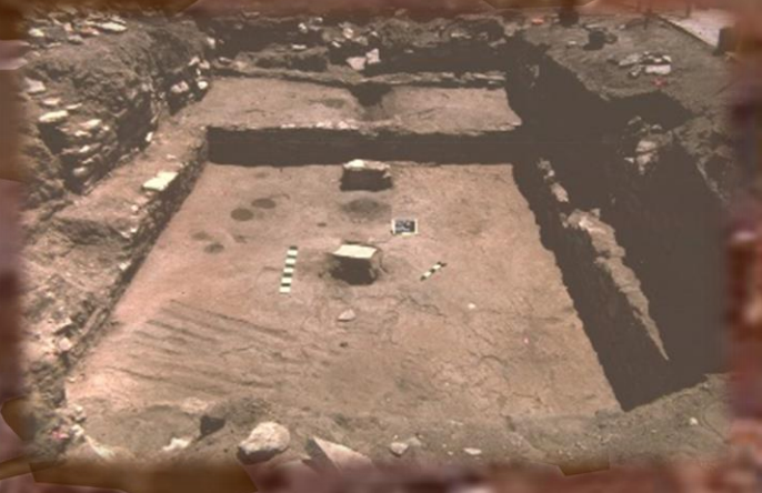
T-shaped kiva excavated at Homol'ovi II Pueblo

12 noon* Friday September 8 to 1 pm* or later Saturday September 9, 2023