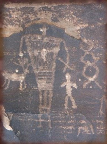
Petroglyphs in Chevelon Canyon

For details and reservations contact Old Pueblo Archaeology Center at 520-798-1201 or info@oldpueblo.org .