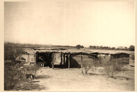
Typical home in Yoem Village, Marana, Arizona, 1936 Homes were built with railroad ties, saguaro cactus ribs, and mud, with sheet metal roofing.