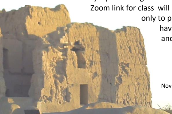
Flyer version of November 26, 2022

Zoom link for class will be provided only to persons who have registered and paid.