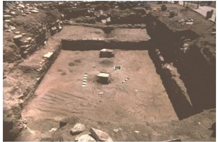
T-shaped kiva exposed in Homol’ovi II site archaeological excavation

1 p.m. Saturday September 10 to 1 p.m. or later Sunday September 11, 2022