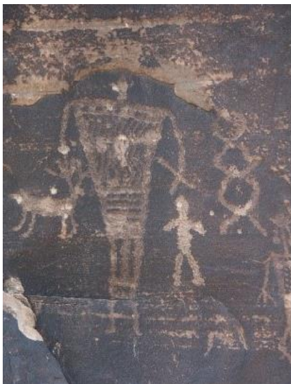
Precontact-era petroglyphs in Chevelon Canyon

If traveling from Tucson, plan on a minimum of 5½ hours one-way driving to Homol’ovi SP depending on general traffic conditions and how many pit stops you make.