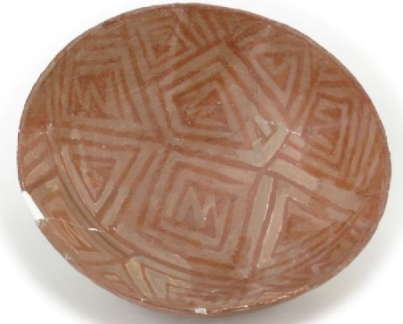
San Francisco Red and Mogollon Red-on-brown pottery