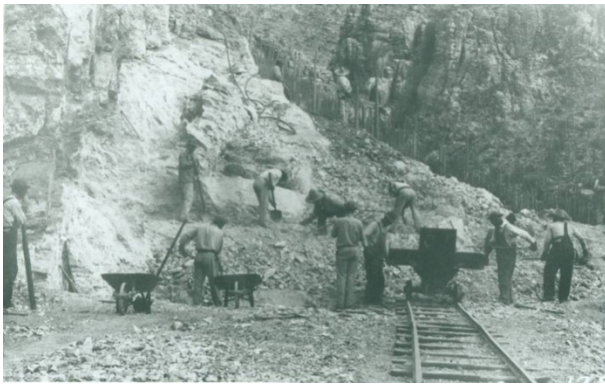
Prisoners excavating a road cut through an outcrop near Soldier Canyon

A unique archaeological site in the Santa Catalina Mountains is the location of a federal prison camp occupied in the mid-20th century. The facility was established for one specific purpose: to provide labor for construction of the Catalina or Hitchcock Highway connecting Tucson to Mount Lemmon. Although the project started in 1933, it wasn't until 1939, when road construction had reached the 7-mile mark, that prisoners were moved from their temporary camp at the base of the mountain to the permanent one at a relatively flat valley setting adjacent to Soldier Creek and the highway. (This appealing location was used by the Hohokam at a much earlier time, as marked by petroglyphs, grinding features, and artifacts.) From 1933 to 1951 some 8,000 prisoners worked on the highway project, often with more than 200 in the camp at any time.