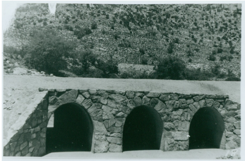
Example of prisoners' workmanship at a Catalina Highway drainage feature

Tour meets at Safeway store parking lot, 9125 E. Tanque Verde Rd., Tucson (at Catalina Highway intersection)