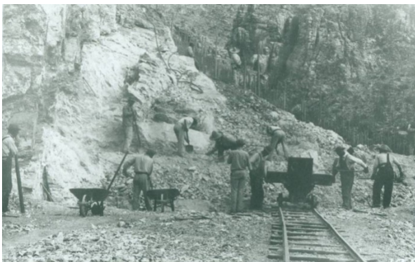
Prisoners excavating a road cut through an outcrop near Soldier Canyon

A unique archaeological site in the Santa