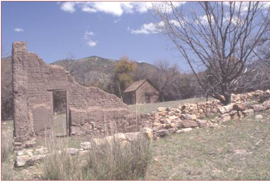
Remnants of Camp Rucker's adobe Commissary and Bakery buildings constructed by soldiers in 1880