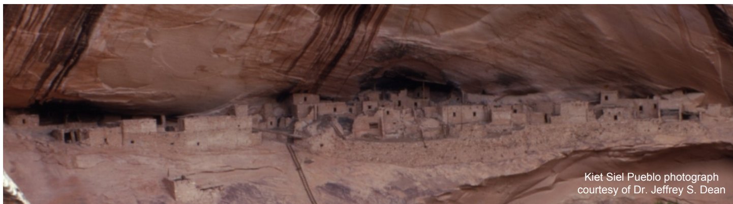
Kiet Siel Pueblo

A Course for General Interest or Arizona Archaeological Society Credit