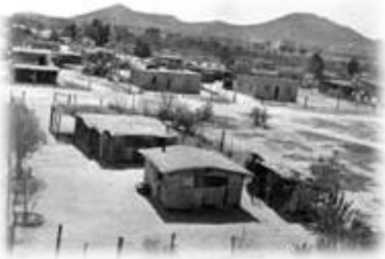
Pascua Yoeme Community ca. 1938

Reservations and prepayment required by Wednesday October 25