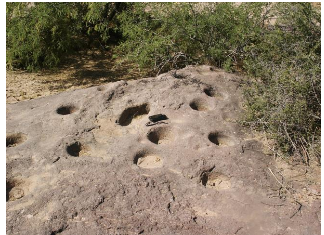
Bedrock mortars for which “Los Morteros” is named

Los Morteros , an ancient village site of the Hohokam Indians from about A.D. 850 to 1300, has been studied by archaeologists and historians for more than a century. During its heyday it was the center of an extended community of related Hohokam sites along the Santa Cruz River. The core of Los Morteros, which is now preserved in a Pima County natural and cultural resources park, encompasses a large public architectural feature interpreted as a ballcourt used for ritual and other purposes, plus many refuse mounds, room blocks, hundreds of pithouses, and thousands of artifacts. Bedrock mortars that inspired the site’s name ( Los Morteros is Spanish for “the mortars”) and petroglyphs also are present.