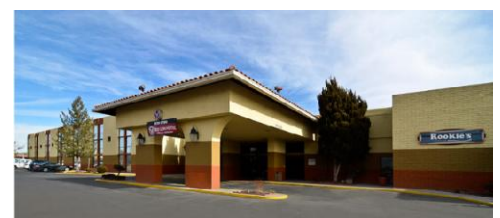
Red Lion Hotel, 700 Scott Ave., Farmington* www.redlion.com/our-hotels/new-mexico/farmington/

Visit Lalios Family Home to see their native pottery and jewelry.