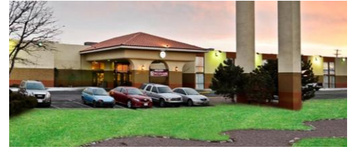
Red Lion Hotel, 3009 W. Hwy 66, Gallup, NM* www.redlion.com/our-hotels/new-mexico/gallup/