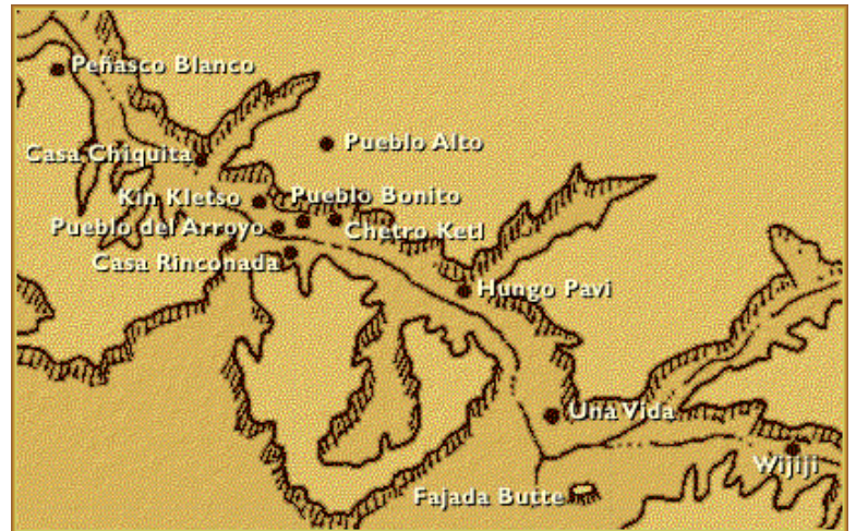
Chaco Canyon’s major pueblo sites map from www.colorado.edu

Meet at Red Lion Hotel in Farmington. Leave at 8 a.m. MDT for Chaco Canyon via US-64, US-550, and north entrance to canyon.