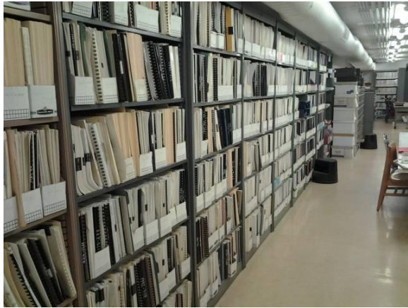
Just a few of the archaeological site records at the Arizona State Museum, University of Arizona, managed by our March guest speaker