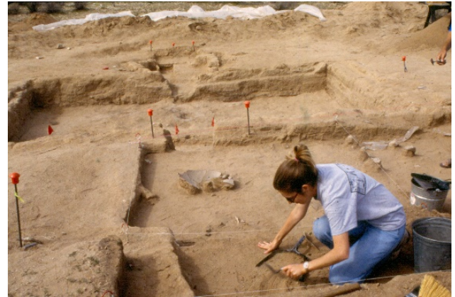
Some adobe-walled structures discovered during the Marana Mound Community excavations

The Marana Mound site is one of the very few Hohokam Early Classic period (AD 1150-1300) villages that has wholly escaped the destruction resulting from modern agriculture and urbanization and where adobe-wall remnants still can be clearly identified on the surface. The mound itself was a large, platform-type ceremonial structure built inside a massive, walled compound that itself was surrounded by additional compounds, other Hohokam living areas, and outlying agricultural fields, some of which were irrigated from a nearly seven-mile-long canal and others on the mountain slopes that specialized in growing agave plants for food and textile-making materials and that were watered by direct rainfall. We also will visit the location where a segment of the nearly seven-mile-long Marana Mound site canal was identified from surface and excavated remains before the area was included in a modern housing development. These site visits will provide a basis for understanding the social and economic processes during the Early Classic period, when processes of Hohokam centralization and population aggregation greatly accelerated.