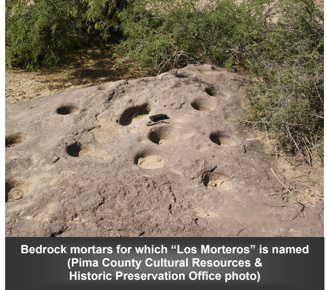
Bedrock mortars for which “Los Morteros” is named

Los Morteros , an ancient village site of the Hohokam Indians from about A.D. 850 to 1300, has been studied by archaeologists and historians for more than a century. During its heyday it was the center of an extended community of related Hohokam sites along the Santa Cruz River. The core of Los Morteros, which is now preserved in a Pima County natural and cultural resources park, encompasses a large public architectural feature interpreted as a ballcourt used for ritual and other purposes, plus many refuse mounds, room blocks, hundreds of pithouses, and thousands of artifacts. Bedrock mortars that inspired the site’s name ( Los Morteros is Spanish for “the mortars”) and petroglyphs also are present.