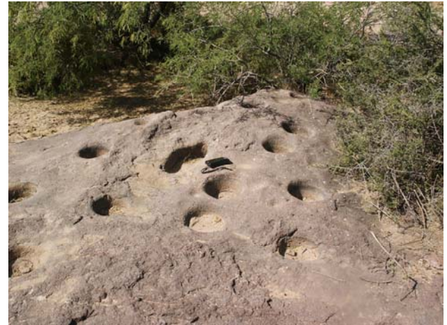
Bedrock mortars for which “Los Morteros” is named

Los Morteros , an ancient village site of the Hohokam Indians from about A.D. 850 to 1300, has been studied by archaeologists and historians for more than a century. During its heyday it was the center of an extended community of related Hohokam sites along the Santa Cruz River. The core of Los Morteros, which is now preserved in a Pima County natural and cultural resources park, encompasses a large public architectural feature interpreted as a ballcourt used for ritual and other purposes, plus many refuse mounds, room blocks, hundreds of pithouses, and thousands of artifacts. Bedrock mortars that inspired the site’s name ( Los Morteros is Spanish for “the mortars”) and petroglyphs also are present.