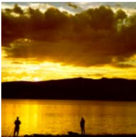
Friday thru Sunday stay in The Jim Click Automotive Team's company condominium in Arizona's White Mountains Donated by Jim Click Automotive Team Value $500