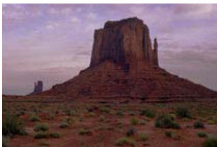
1-night stays for 2 at Navajo Nation's Quality Inn Lake Powell in Page, Quality Inn Navajo Nation Capital in Window Rock, and Quality Inn Navajo Nation in Tuba City Donated by Navajo Nation Hospitality Enterprise Value $278